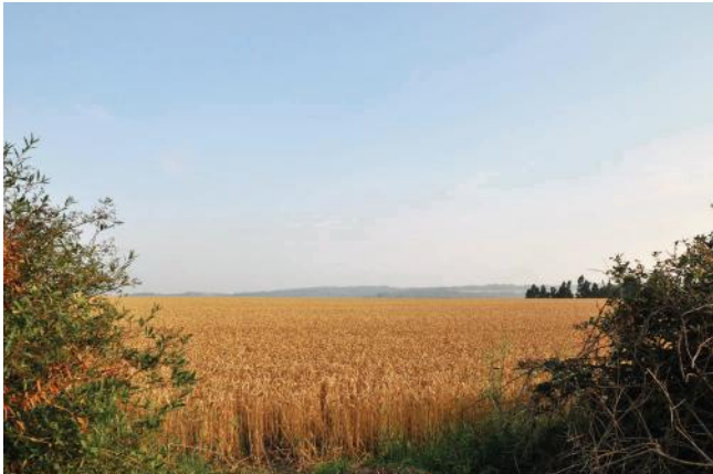
The Oxford Green Belt needs your help now