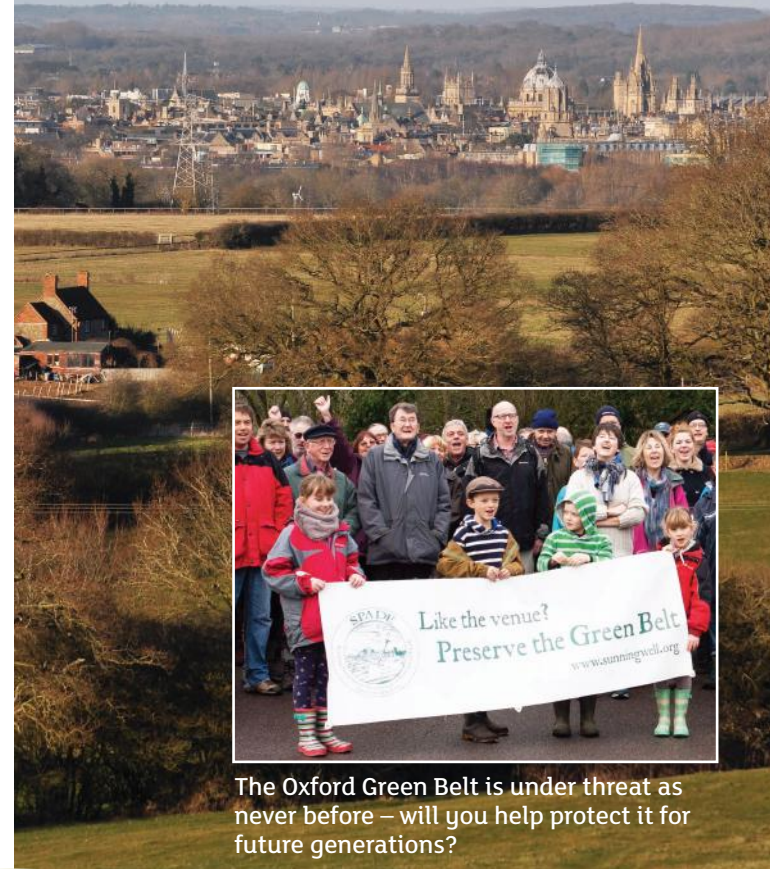
The Oxford Green Belt is under threat as never before – will you help protect it for future generations?